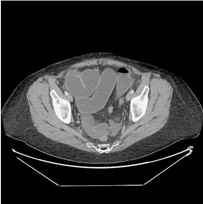
Fig. 3. Abdominal/pelvic CT of small bowel obstruction with transition point.