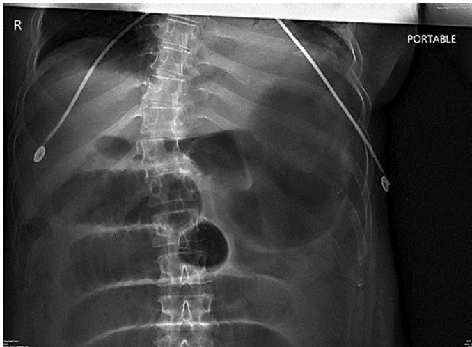
Fig. 2. Abdominal X-ray demonstrating obstruction.