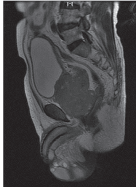
Figure 1. MRI scan showing the prostatic neoplasm, without a neoplasm of the bladder or other areas of the urethra, but with skeletal metastasis.

with dense or abundant cytoplasm and striking nuclear pleomorphism, with the absence or rarity of glandular lumina. The serum free PSA level is a main marker for prostate cancer screening. However, in the present case, the serum PSA level was high (1,130 ng/ml), indicating prostate cancer. UC was detected by transurethral biopsy. A bone ECT revealed multiple bone metastases. Due to these factors, achieving a definite diagnosis was difficult. In order to identify the origin and character of the prostatic cancer, a panel of immunohistochemistry was selected.