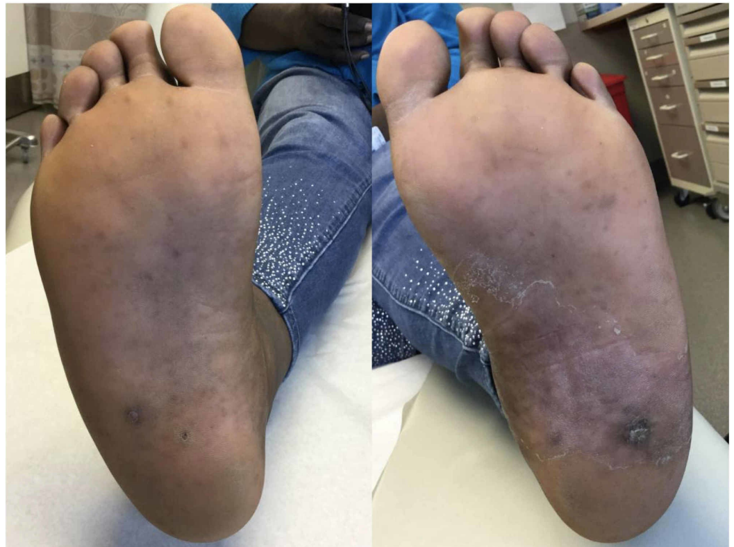
FIGURE 1: Multiple verrucous and hyperkeratotic lesions on the bilateral plantar feet.

achieved remission, but her post-transplantation course was complicated by multisystem graft-versus-host disease (GVHD) requiring long-term immunosuppressive therapy. Examination of the feet revealed a 1 cm verrucous plaque on the left plantar surface with an adjacent 0.5 cm papule and two similar-appearing lesions on the right plantar foot (Figure 1).