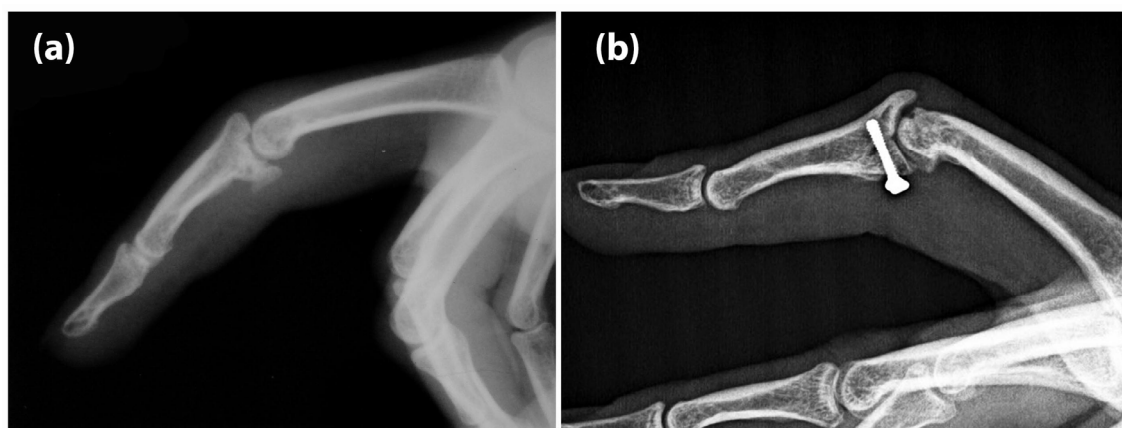
Fig. 4. (a) Preoperative X-ray of a chronic PIP joint fracture dislocation (Case No 1); (b) Degenerative joint disease 41 months after hemi-hamate arthroplasty (case No 1). Surgery was performed 230 days after injury.

with the mean DASH score and VAS of 10 and 2 in acute and 5.8 and 0.42 in chronic cases.