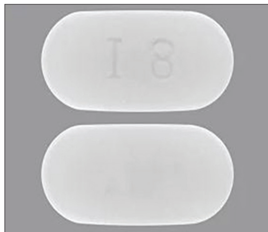
Figure 3: Sevelamer Carbonate 800 mg

stricture formation, leading to lobar atelectasis. [7] Sevelamer tablets are radiolucent and not visible on radiography or CT-scan so it can be difficult to diagnose without history. [8] Diagnosis and treatment of sevelamer aspiration is done by flexible or rigid bronchoscopy and removal of tablet along with tissue biopsy of airway. Pathological examination of inflamed bronchial mucosa can show broad, curved internal fish scale appearance with deposition of sevelamer. [8,9] As the duration between the aspiration of sevelamer pill and flexible bronchoscopic removal was ~16 h in our patient, we