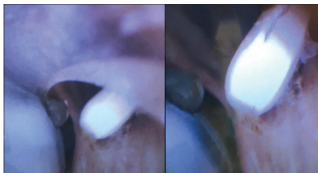
Figure 1: Fiberoptic bronchoscopy view through tracheal lumen of DLT, Carina with Bronchial cuff on left side and tablet on right