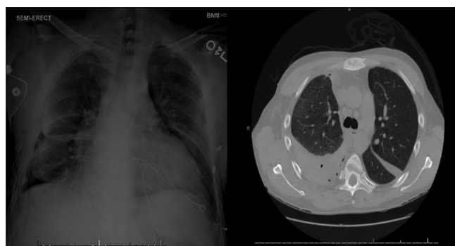
Figure 2: X-ray image on the day of surgery, CT chest image at the level of carina with no obstruction 2 days before surgery