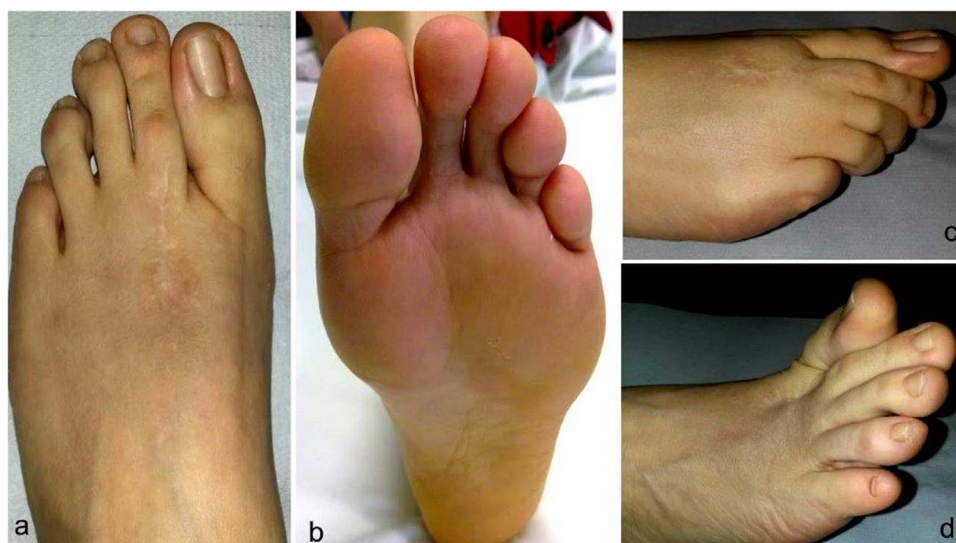
Fig. 4. clinical examination 42 months after surgery: a) dorsal and b) plantar view of the foot; c) Flexion and d) extension of the MTPJ of the second ray.

dorsal closing-wedge osteotomy has been widely performed with good results since Gauthier [8] first described this technique.