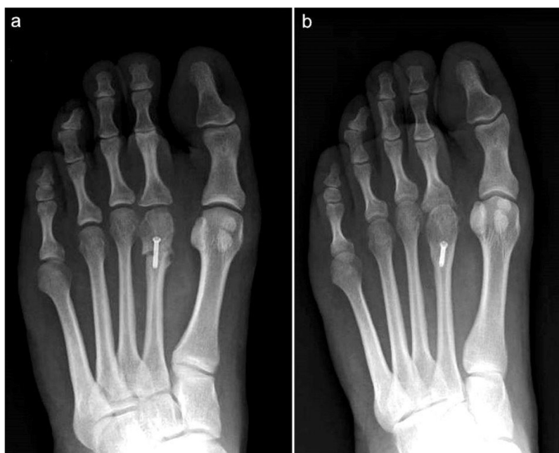
Fig. 3. a) post-operative antero-posterior view of the foot; b) weight bearing view, four weeks post-operative, showing the restoration of a normal articular surface of the second metatarsal head.