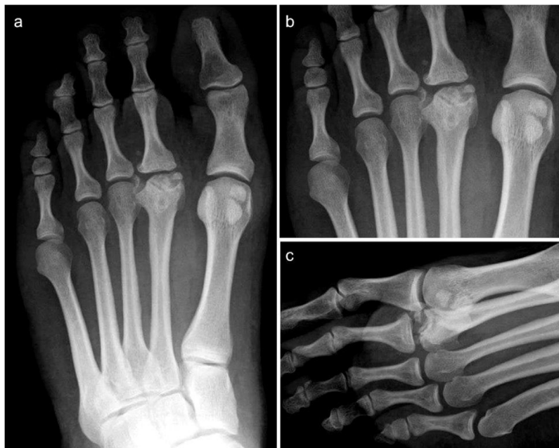
Fig. 1. Preoperative weight bearing x-rays of the left foot: a) antero-posterior view showing an alteration of the articular surface of the head of the second metatarsal, which appears flattened and sclerotic; b) particular of the first figure of the second metatarsal head. In this figure the alteration is clearly visible and it seems that the head is fragmented; c) lateral (lateral oblique) view showing the lesion. In this figure, Freiberg's infraction grade IV could be conceivable.