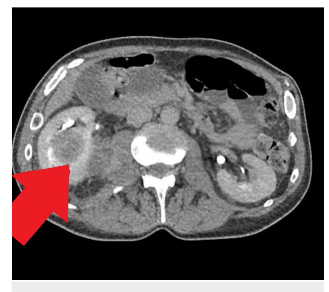
FIGURE 2: Right renal abscess on the computed tomography scan