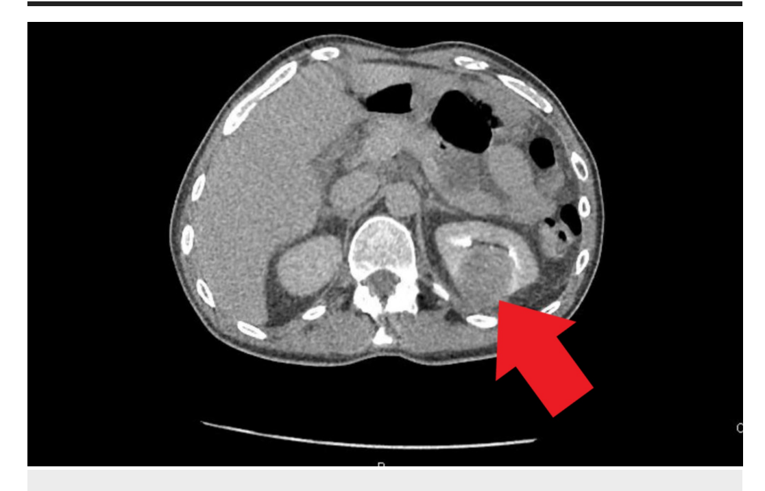
FIGURE 3: Left renal abscess as noted on the computed tomography scan

FIGURE 2: Right renal abscess on the computed tomography scan