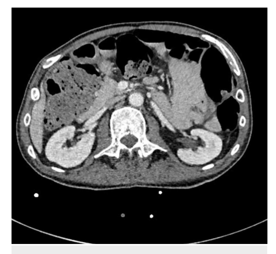
FIGURE 4: Resolution of bilateral renal abscesses

A follow-up CT of abdomen and pelvis at the end of therapy to look for resolution of the abscesses was performed at four weeks, which showed interval decrease in bilateral renal abscesses, resolution of the PA but demonstrated a persistently enlarged prostate suspicious for either a benign or a malignant prostate pathology (Figures 4-5 ).