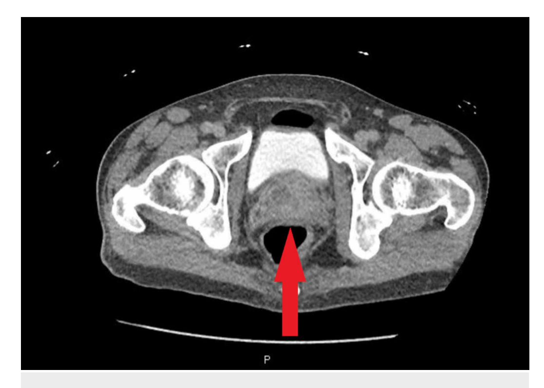
FIGURE 1: Prostate abscess extending into the seminal vesicles bilaterally seen on computed tomography scan with contrast

A 53-year-old man with a medical history significant for schizophrenia, hypertension, and intravenous drug use (IVDU) presented to the hospital with complaints of abdominal pain for one week with associated nausea, vomiting, diffuse myalgia, malaise and decreased appetite for one month. The patient also reported a chronic non-productive cough without hemoptysis and night sweats over the past one year. The patient reported that he stopped IVDU almost two years ago. On initial evaluation, the patient was afebrile, other vitals within limits. Physical examination revealed suprapubic tenderness, costovertebral angle tenderness and was otherwise unremarkable. Laboratory workup revealed leukocytosis (white blood cell (WBC) 12.6x103/uL) and transaminitis (alanine aminotransferase (ALT) 206/aspartate aminotransferase (AST) 166 IU/ml). Urinalysis revealed 42 WBCs/ HPF, 2+ leukocyte esterase, trace bacteriuria, urine culture was awaited. Computed tomography (CT) of the abdomen and pelvis with contrast revealed multiloculated abscesses in both the kidneys and a 5.7 cm multicystic abscess in the prostate extending into the bilateral seminal vesicles (Figures 1-3).