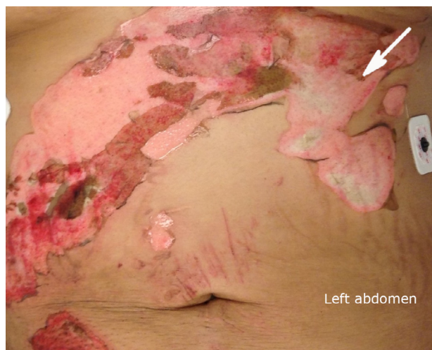
Fig. 2 – Clinical photograph of the same patient’s full thickness burn. Photograph of anterior abdominal wall at the bedside shows pink/pale areas in the anterior abdomen secondary to the full thickness burn injury (arrow).

of 3 layers which include epidermis, dermis, and hypodermis. The 2 first layers are typically 1-4 mm in thickness [13]. On the CT imaging, these 2 layers cannot be resolved and represent the relatively hyperdense layer of the skin [7,12]. The hypodermis layer or subcutaneous soft tissue is comprised of fatty tissue with interspersed neurovascular nerve structures. The average subcutaneous fat thickness in the abdominal wall is 2-4 mm [13,14]. This layer generally demonstrates hypodensity on CT imaging because of fatty components. Below the hypodermis are a firm collagenous deep fascia. Further below lies the deep fat layer and investing fascia of the musculature [15,16].