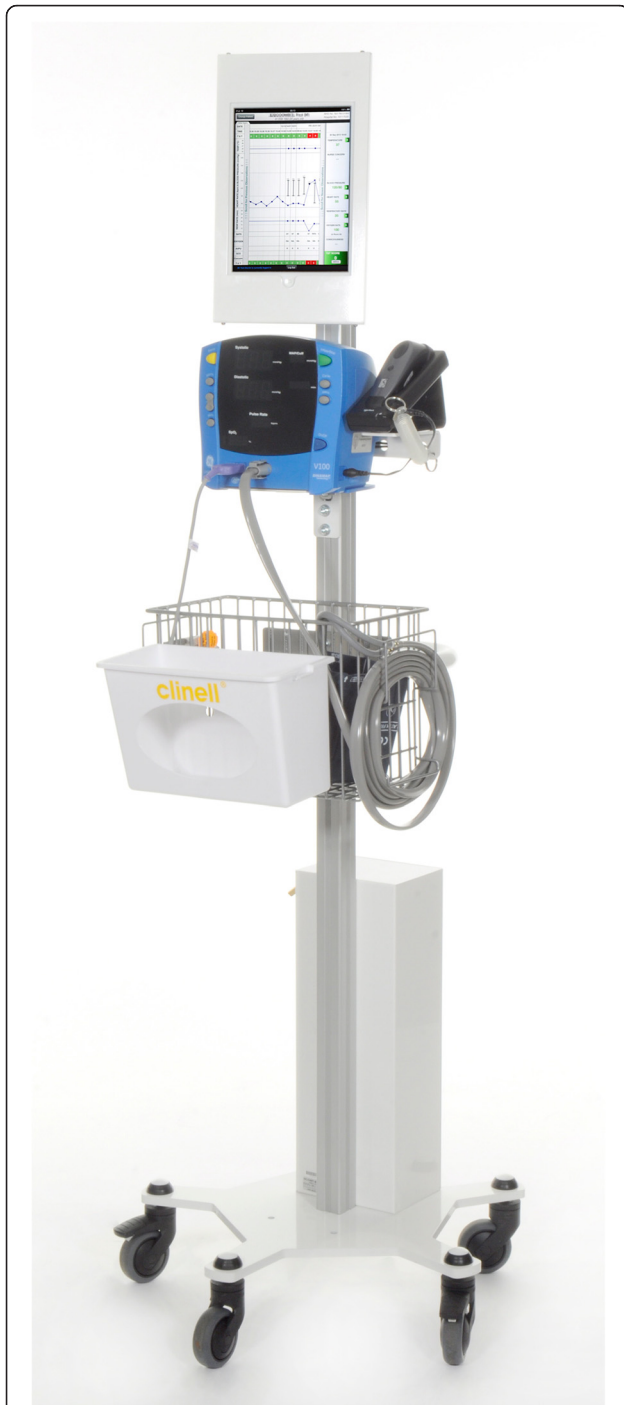
Fig. 1 The SEND data entry hardware. Observation roll stand with equipment for taking observations, barcode scanner and tablet computer

implemented for all patients within a ward. It is not removed once implemented in a study ward. Roll out must proceed sequentially across all wards. The order of ward roll out is dictated by operation factors and patient safety considerations therefore it is not be possible to