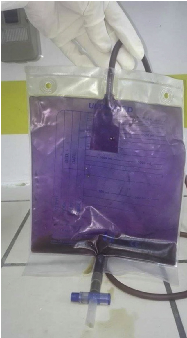
Fig. 1. Purple discoloration of urine bag.

disorder in tryptophan intestinal absorption, which is eliminated and metabolised in urine, causing its discoloration. 3