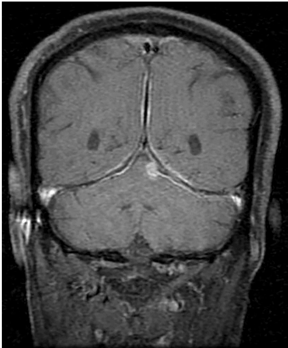
FIGURE 2: Posttreatment at 24 months: Post-gadolinium coronal T1-weighted MRI showing almost complete resolution of dural enhancement.