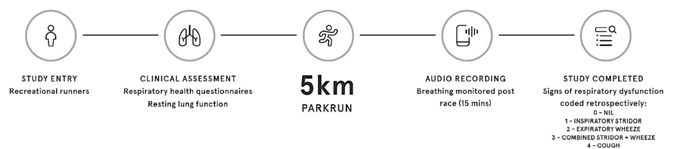
Figure 1 Schematic detailing experimental design.

Breathing sounds during exercise were self-recorded by the participant using an in-built audio-recording application on a smartphone. At the start of the race, participants launched the application in preparation to begin recording at peak exercise (ie, approaching and crossing the finish line) and immediately postrace for 15 min or until resting tidal breathing had resumed. To optimise signal-to-noise ratio (ie, minimise distortion and background noise), participants were instructed to hold the smartphone approximately 10–15 cm away from their