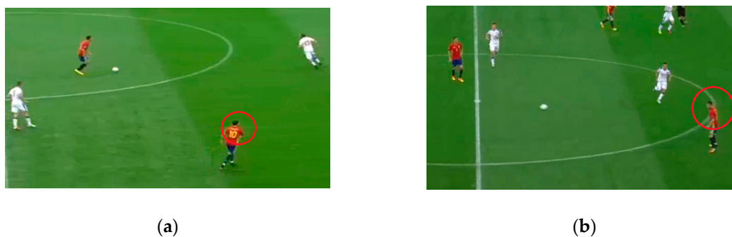
Figure 1. (a) Player (red circle) performs a scan by turning his head and looking away from the player in ball possession. (b) Player (red circle) performs a transition scan by turning his head and looking away from the player and the ball while the ball is in transition.

We defined a scan based on the definition of Jordet, as a body and/or head movement where the observed players look away from the ball with an active rotational neck movement in dynamic gameplay situations except while receiving the ball as shown in Figure 1a [14]. A transition scan was defined as a scan that was performed while receiving the ball, after the ball had already left the previous passer's foot and was in transition to the observed player as shown in Figure 1b. The third parameter was total scans, which is the sum of scans and transition scans. Scans, transition scans, and total scans served as independent variables for the regression analysis.