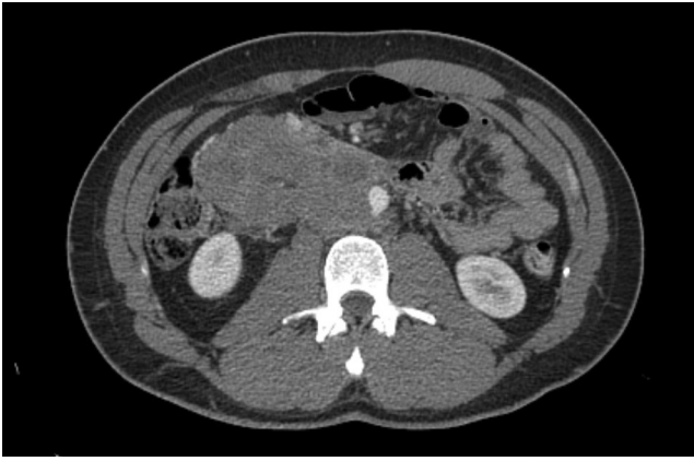
Figure 2. Computed Tomography demonstrating large right-sided retroperitoneal mass, measuring 13 \times 11 \times 7 cm, encasing the aorta and compressing the inferior vena cava and right ureter.

2 cm focus of poorly-differentiated high grade small round blue cells resembling malignant primitive neural elements. The primitive tumor cells showed immunohistochemical expression of synaptophysin but not of CD99 (Fig. 2). Embryonal carcinoma and rhabdomyosarcoma were excluded by immunohistochemistry (negative SALL4, OCT4, desmin and myogenin). The morphology and immunophenotype of the cells in question was classified as a form of central nervous system-type primitive neuroectodermal tumor (CNS-type PNET). Re-examination of the slides of the primary testicular tumor did not reveal any similar tumor component but it was not possible to determine the tumor type that originally occupied the areas of necrosis and scar adjacent to viable seminoma and teratoma.