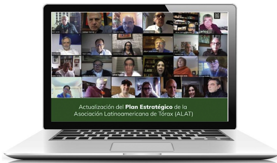
Figure 1. Participants in the ALAT Strategic Plan 2021–2026.