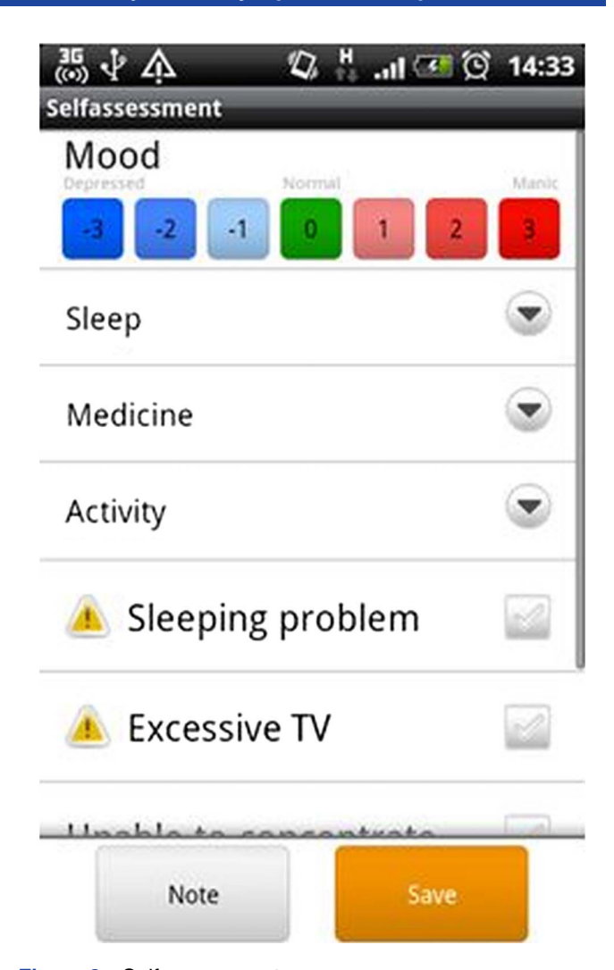
Figure 3 Self-assessment.

A standard of scoring thresholds on the subjectively monitored items for when the study nurse should contact patients was made. For example, the patients had to be contacted if they registered \geq -2 or+ 2 in their mood for 2 days, if they registered changes in their sleep patterns of 1 h more or less for 3 days, if medication was