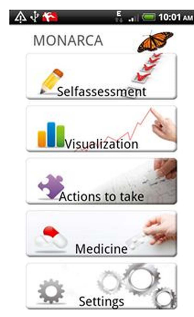
Figure 2 Frontpage.

Patients allocated to the placebo arm were similarly assigned a nurse (other than HSN, but similarly experienced with bipolar disorder) on clinical indication as part of the standard treatment in the clinic, for example, when upcoming or deterioration of depressive or manic symptoms, but this nurse did not have access to electronic daily data of the patient.