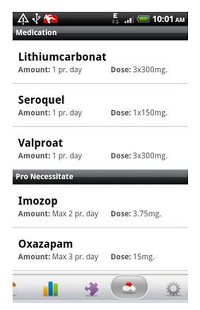
Figure 5 Medication.

All assessments were carried out by two physicians (MFJ and ASJ) who were not involved in the treatment of the patients. The patients were enrolled in the trial for a 6-month study period and assessed every month (table 1). The bipolar diagnosis was confirmed by a SCAN interview before inclusion of the patient.<sup>32</sup> Every month the affective symptoms were clinically rated using HDRS<sup>33</sup> and YMRS.<sup>34</sup> The following questionnaires were fulfilled every month when visiting the researcher; Psychosocial Functioning (Functioning Assessment Short Test, FAST),<sup>36</sup> Cohens' Perceived Stress Scale,<sup>37</sup> quality of life (WHOQOL),<sup>38</sup> coping strategies (CISS),<sup>39</sup> self-rated