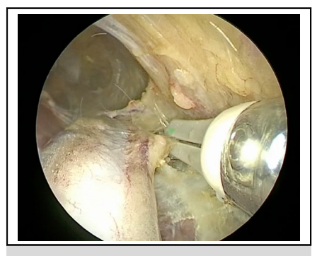
Intraoperative image showing endoscopic radial artery harvesting.

In 2013, we therefore sought out to perfect a modified, touchless technique that entailed a reduction in the number