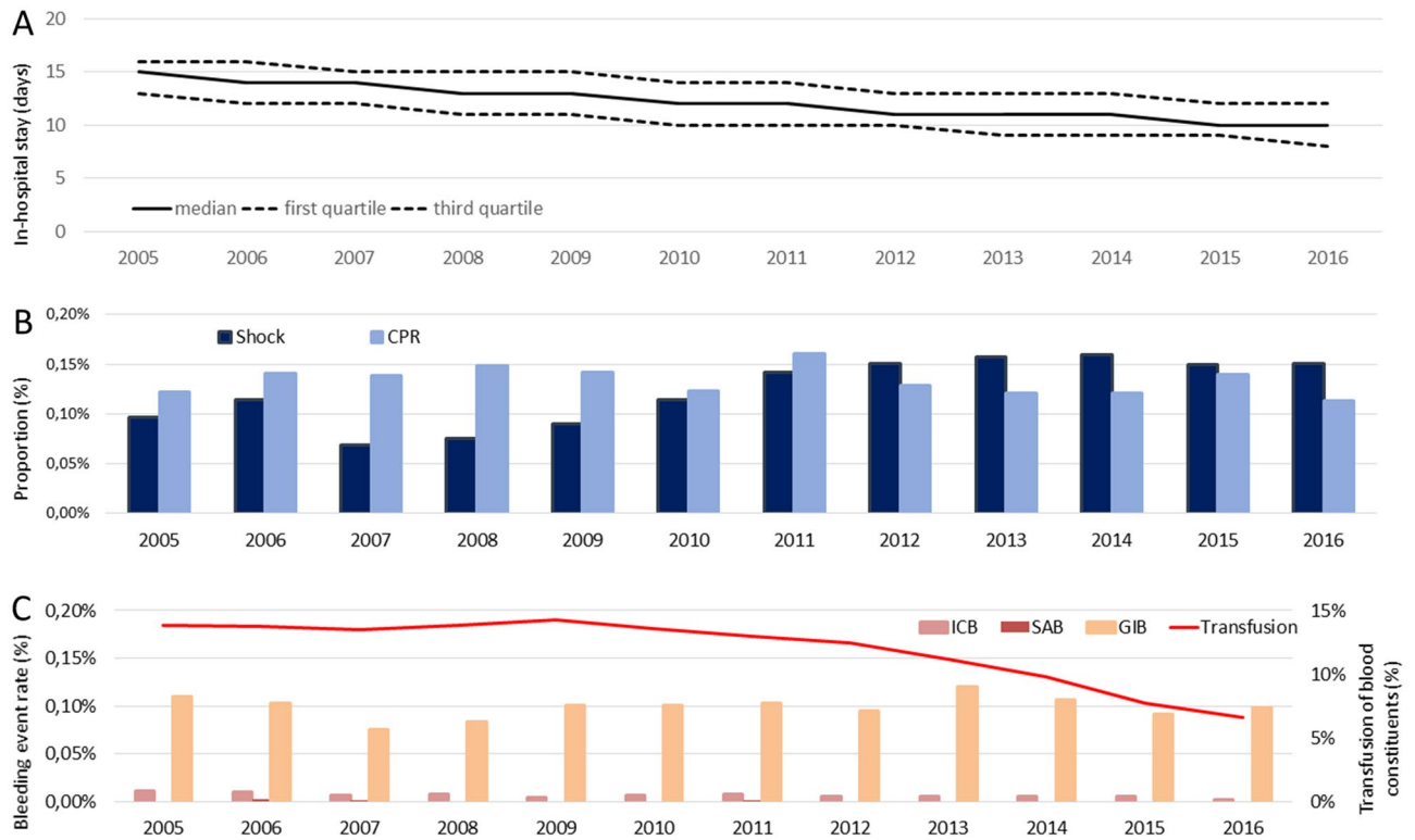
Figure 2. Time trends in length of hospitalization and rates of serious complications in patients undergoing elective primary KJR in Germany from 2005 to 2016. (A) Median duration of hospitalization (solid black line) with 25% and 75% IQR (dashed black lines). (B) Percentage of patients developing shock (dark blue bars) and undergoing cardio-pulmonary resuscitation (CPR, light blue bars) out of all patients undergoing elective KJR. (C) Percentage of patients with bleeding events such as intracerebral bleeding (ICB, light red bars), subarachnoid bleeding (SAB, dark red bars) and gastrointestinal bleeding (GIB, orange bars) as well as necessitation for transfusions of blood constituents (red line) out of all patients undergoing elective KJR.