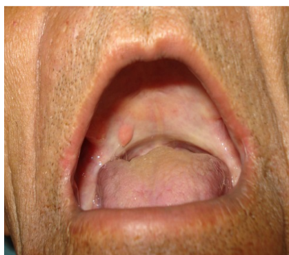
Fig 1. Photograph showing lesion in the palate in case-3.