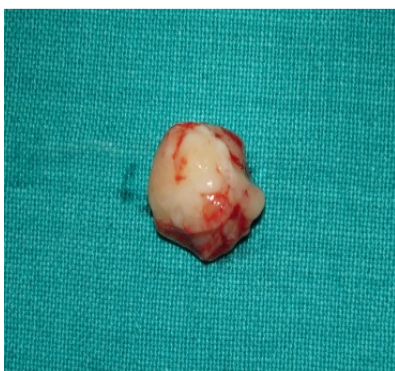
Fig 2. Macroscopic appearance of the lesion in case-2.