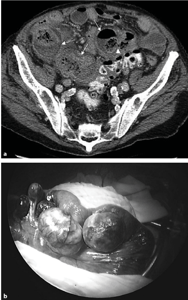
Fig. 1. a Axial CT image showing multiple diverticula (white arrows) on the mesenteric border of the jejunum, surrounded by inflammatory mesenteric fat. The arrowhead shows the communication between one diverticula and the jejunal lumen. b Intraoperative view of the jejunum showing multiple diverticula, the largest being partially covered with white fibrinous exudate.