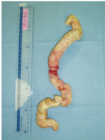
FIGURE 4: The foreign body removed from the gastrointestinal tract by surgery. Casting PUF was found to occupy the intestinal tract. The shape of the PUF fragment matched that of the section with gas detected on the left side of the colon in plain abdominal radiographs.

the two components are mixed, a foam almost 10–20 times the original volume is created in a few minutes. Finally, a hard, brittle sponge-like product is obtained. The patient inserted about 70 mL of the mixture into his rectum using a catheter-tip syringe. It expanded and occupied the rectum, left and distal portion of the transverse colon, forming a casting type of CRF.