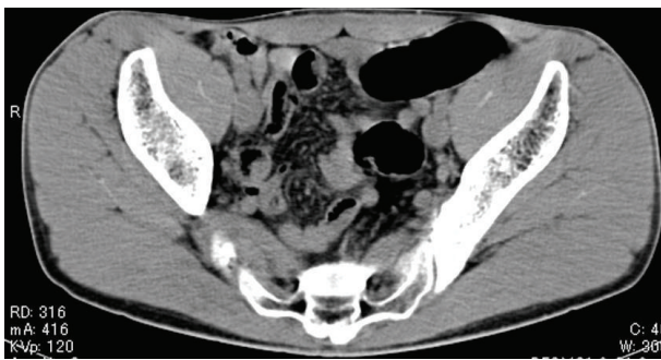
FIGURE 2: Initial computed tomography image. The image shows only normal gas distribution in the gastrointestinal tract; there is no indication of a foreign body.

exact location were not depicted contrary to our expectations (Figure 2). An endoscopy showed a yellowish mass with a sharply demarcated margin 7 cm from the anal ring, perhaps the lower edge of the foreign body. A physician promptly tried to retrieve it using alligator forceps, but the foreign body was fixed, brittle, easily crushed, and the strategy was not successful. Precise reevaluation of CT images taken with the air attenuation display setting revealed abnormal reticular strands from the distal transverse colon to the rectum, probably corresponding to the foreign body created by PUF (Figures 3(a) and 3(b)). We decided that it was impossible and dangerous to retrieve it per anus because it occupied a long segment on the left side of the transverse colon; therefore, operative removal was selected. The foreign body was removed through the incision in the sigmoid colon. The foreign body was composed of PUF and corresponded to the gas trapped on the left side of the colon on the plain radiograph (Figure 4). However, the PUF was brittle material and was easily crushed into many pieces by colonic peristalsis. Unexpectedly, it was distributed to the proximal portion of