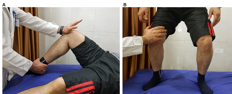
Figure 4 Waldron's test: (A) Phase I and (B) Phase II.