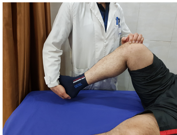
Figure 2 Patellar apprehension test.

To do Phase I of Waldron's test, patient lies supine and the examiner presses the patella against the femur while concurrently performing a passive knee flexion with the other hand (Figure 4A). 110 For Phase II, the standing patient performs a slow, full squat, again with the examiner performing a gentle compression of the patella against the femur (Figure 4B). In