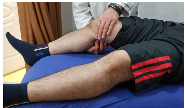
Figure 5 Clarke's test.