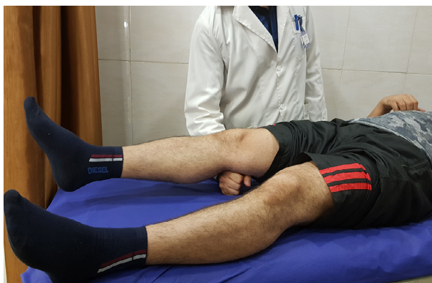
Figure 1 Vastus medialis coordination test.

In patient's supine position, the examiner places the fist under the subject's knee and asks the patient to extend the knee slowly without pressing down or lifting away from the examiner's fist. The patient is instructed to achieve full extension (Figure 1). The test is considered positive when a lack of coordinated full extension is apparent, that is, when the patient either has difficulty smoothly achieving extension or uses the extensors or flexors of the hip to accomplish extension. A positive test may be an indicator of dysfunction of the vastus medialis obliquus muscle. 105,107