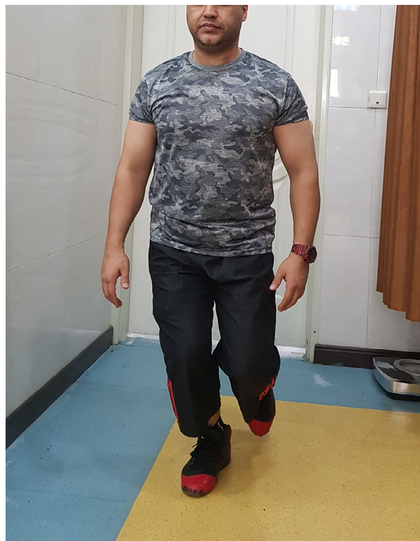
Figure 7 Single-leg squat.

Single-leg squat is a test of dynamic hip and quadriceps strength in the examination. This maneuver imposes higher