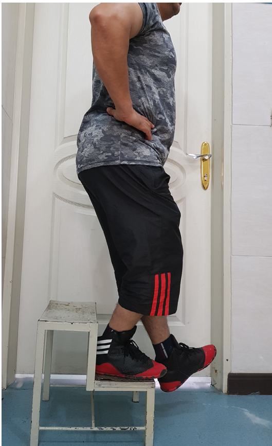
Figure 3 Eccentric step test.

Standard step-down test is very similar to eccentric step test, except that the patient should stand with arms folded across the chest and be instructed to squat down 5–10 times consecutively in a slow and controlled manner until the heel touches the floor, maintaining their balance at a rate of approximately one squat per 2 s (Figure 6). Scoring of the deviations in the trunk, pelvis, hip and knee reveals the onset timing of the