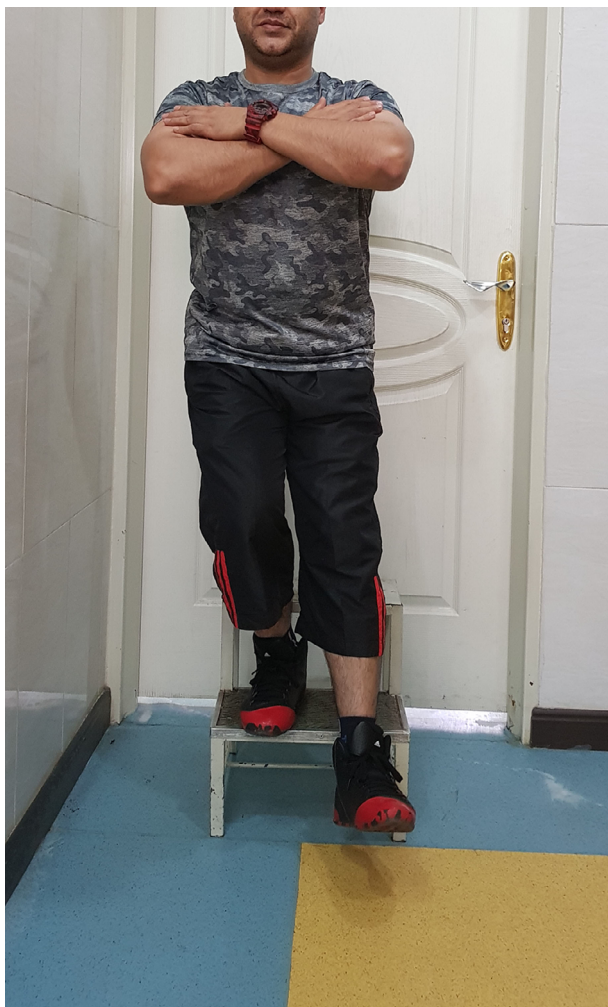
Figure 6 Standard stepdown test.

anterior gluteus medius, hip abduction torque and decreased lateral trunk strength. 100 Excellent inter-rater ( k=0.80 ) and intra-rater ( k=0.80 ) reliability has been reported for this test. 111