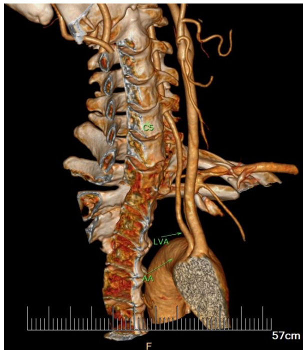
Figure 1. Typical case of subjects with LVA arising from aortic arch. The distal segment enters the transverse foramen at C5 level higher than normal.