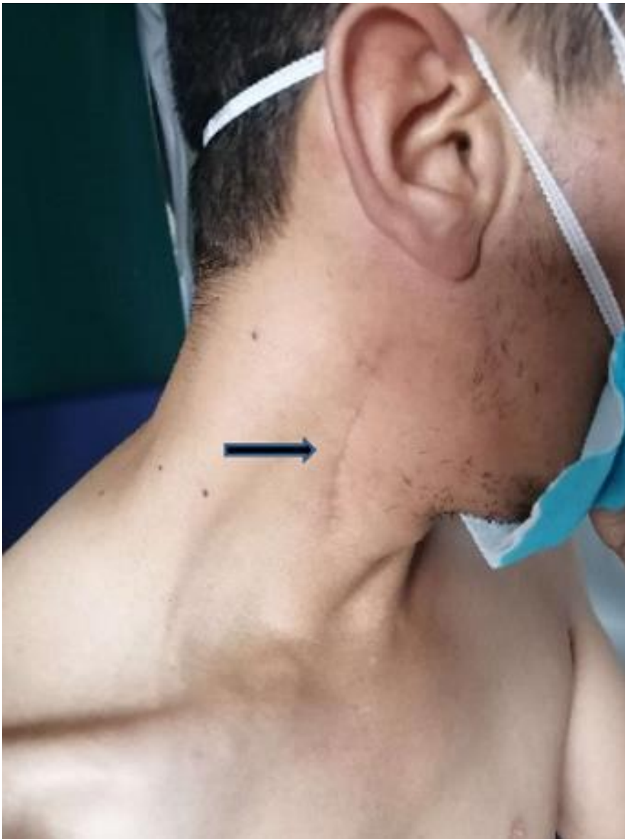
Figure 1: anterolateral scar on the right side of the neck