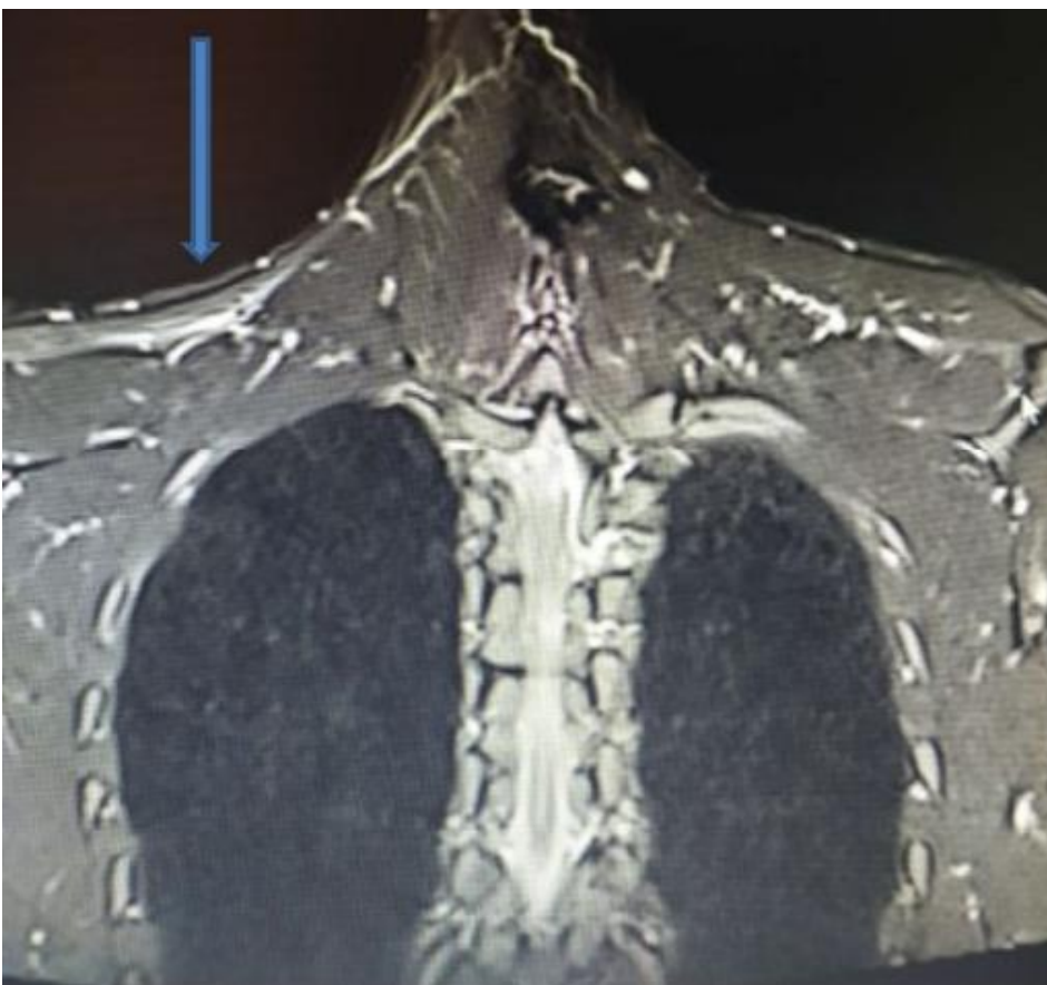
Figure 3: MRI of the brachial plexus, coronal cut in T2 sequence: wasting of the right trapezius muscle with denervation edema