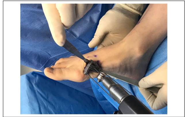
Figure 6. Cutting jig: Follow the cutting slot on the jig to perform the osteotomy at the desired angulation.