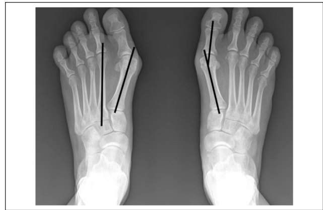
Figure 1. Anteroposterior weight-bearing foot radiograph. Intermetatarsal angle is measured on left foot: 15 degrees; hallux valgus angle is measured on right foot: 30 degrees.

Twenty-five patients (30 feet), 22 women and 3 men of average age 46 years (range 22-59), were operated using this technique and prospectively followed for a minimum of 9 months (average 12 months). Inclusion criteria included symptomatic HV deformities with a metatarsal malrotation of 10 degrees or more and an intermetatarsal angle between 11 and 20 degrees (Figure 1). Exclusion criteria were Juvenile HV, joint arthritis, inflammatory disease, and