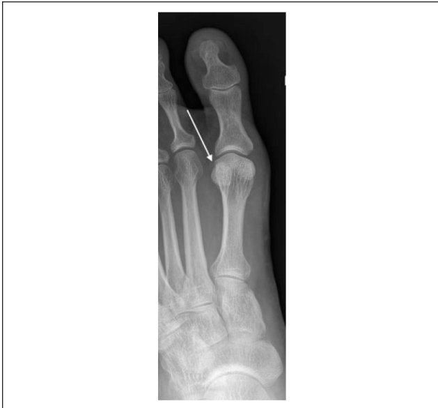
Figure 3. Anteroposterior first metatarsal weight bearing view on a normal foot: a sharp edge can be seen on the lateral edge of the first metatarsal head. Sesamoids located under the head.

Another line is drawn along the weight-bearing surface. The angle between these lines is the first metatarsal rotation (Figure 2). Another option is to perform a preoperative weight-bearing computed tomographic scan. The last method is by using the AP foot radiograph. A round shape on the lateral border of the metatarsal head is evidence of pronation given that metatarsal condyles appear on an AP view as the metatarsal externally rotates (Figures 3 and 4). 30 Given that progressive degrees of rotation show a progressive head shape roundness, the latter can be used to estimate the