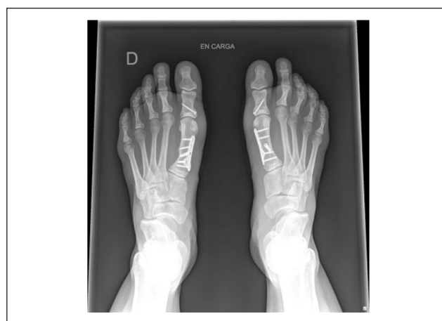
Figure 8. Anteroposterior weight bearing feet view: Postoperative image showing the deformity correction. The sesamoids are located under the head and the metatarsal head recovered its lateral sharp edge thanks to the rotational correction.

Immediate weight bearing was allowed as tolerated. As soon as wounds healed, daily active and passive hallux