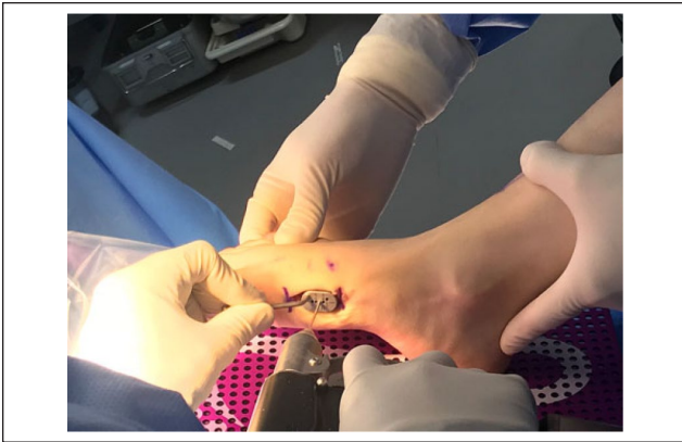
Figure 5. First wire and positioning jig: Foot positioned over a flat surface. First wire is driven through the 0-degree hole on the jig, 1 cm distal to the joint on the metatarsal equator. It has to be parallel to the floor and perpendicular to the metatarsal.

shows the osteotomy angulation that will correct a certain combination of metatarsal internal rotation and varus deformity.