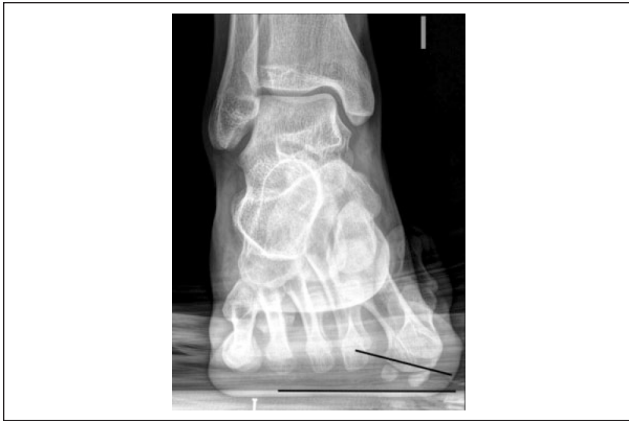
Figure 2. Metatarsal rotation measurement: Modified Bernard view (see text for details). Angle between a line drawn parallel to the floor and a line from the medial ridge of the medial sesamoid facet to the lateral ridge of the lateral sesamoid facet. Value: 15 degrees.