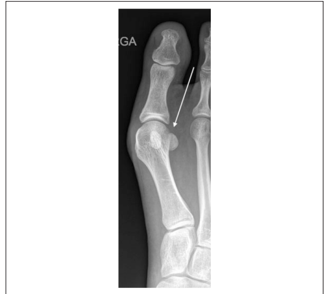
Figure 4. Anteroposterior first metatarsal weight-bearing view on a hallux valgus foot: a round edge can be seen on the lateral edge of the first metatarsal head, which are the visible metatarsal condyles on a rotated metatarsal. Sesamoids rotated laterally from the head.

Another line is drawn along the weight-bearing surface. The angle between these lines is the first metatarsal rotation (Figure 2). Another option is to perform a preoperative weight-bearing computed tomographic scan. The last method is by using the AP foot radiograph. A round shape on the lateral border of the metatarsal head is evidence of pronation given that metatarsal condyles appear on an AP view as the metatarsal externally rotates (Figures 3 and 4). 30 Given that progressive degrees of rotation show a progressive head shape roundness, the latter can be used to estimate the