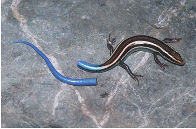
FIGURE 1 Western Skink ( Plestiodon skiltonianus) tail detached from body following caudal autotomy