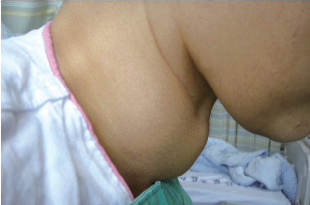
Figure 1. A diffusely swollen and non-tender goiter.

alanine aminotransferase, 66 IU/L; total bilirubin, 4.9 mg/dL; gamma-glutamyl transpeptidase, 984 IU/L; alkaline phosphatase, 694 IU/L; lactate dehydrogenase, 1,301 IU/L; blood urea, 5.5 mg/dL; serum creatinine, 0.4 mg/dL; prothrombin time, 12 seconds; activated partial thromboplastin time, 30.2 seconds; erythrocyte sedimentation rate, 60 mm/hour; and C-reactive protein, 19.45 mg/L.