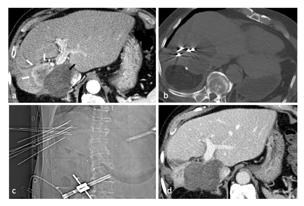
Fig. 2 A Arterial phase CT showing local recurrence with 4.5 cm in diameter (white arrow) directly adjacent to large necrosis zone (black arrow) in November 2012. B , C Axial non-enhanced control CT and

without any additional treatment being required. One year after the last intervention (i.e., June 2019), the patient's liver function was not substantially impaired as illustrated by albumin and bilirubin levels within the physiological range (4126 mg/dl and 0.41 mg/dl, respectively), as well as normal coagulation parameters (i.e., INR of 1.1). In total, 17% of liver volume (April 2007 = 2247 ml; March 2018 = 1865 ml) had been lost over the years.