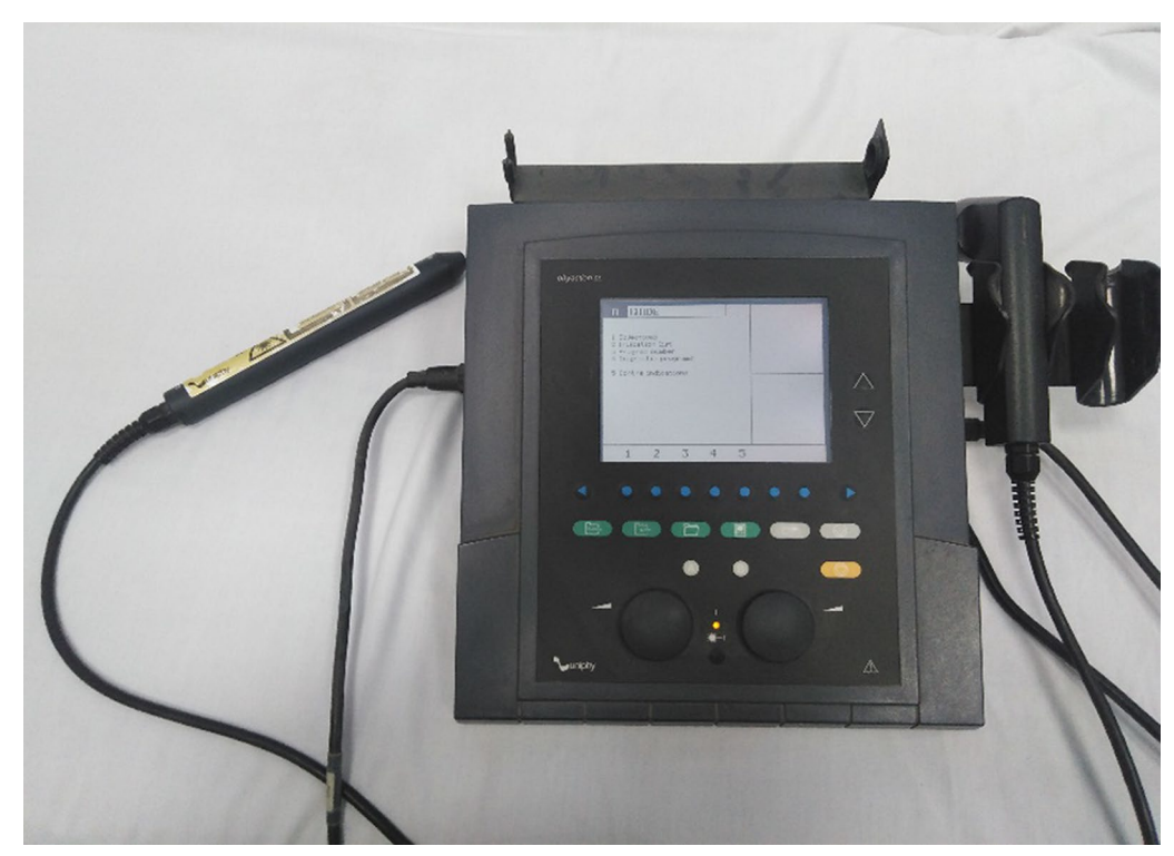
Fig. 1 Laser acupuncture machine phyaction (CL)

Categorical data were presented as numbers and proportions. Paired categorical data was compared using the Mcnemar test. Normality testing was conducted using the Shapiro-walk test. Continuous variables that were normally distributed were presented in terms of mean and standard deviation and compared using paired t-test. The median and interquartile range were shown for nonnormally distributed variables. All statistical tests with a value of P < 0.05 were considered statistically significant. All statistical analyses were done with Statistical Package for Social Sciences (SPSS), version 26 (SPSS Inc, Chicago, IL).