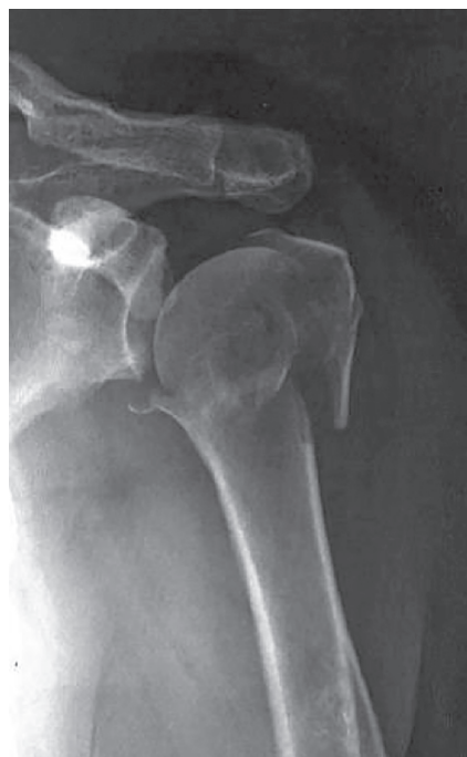
Figure 1. The radiograph shown in the survey; the same for all 5 patient descriptions.

international sample showed high levels of hazardous attitudes. In another study (Kadzielski et al. 2015), a correlation was found between high levels of these hazardous attitudes and the incidence of complications after surgery. These findings seem to suggest that hazardous attitudes may have some role in explaining why orthopedic surgeons operate too much. We tried to determine whether risk preferences and hazardous attitudes of orthopedic surgeons are associated with the likelihood of recommending surgical treatment