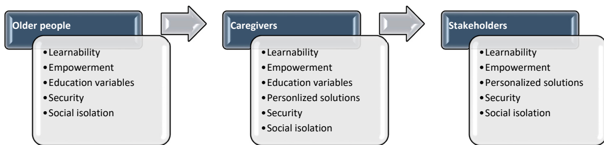
Figure 3. The six themes emerged from the thematic analysis in the three groups.