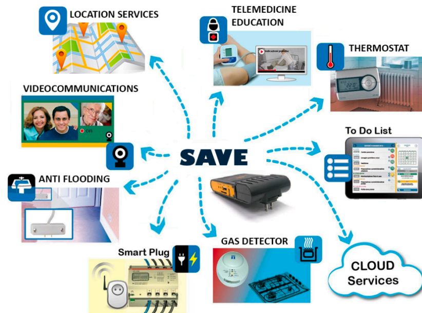
Figure 1. The original concept of the SAVE architecture based on multiple smart-home and wearable sensors streamed to a cloud-based platform.