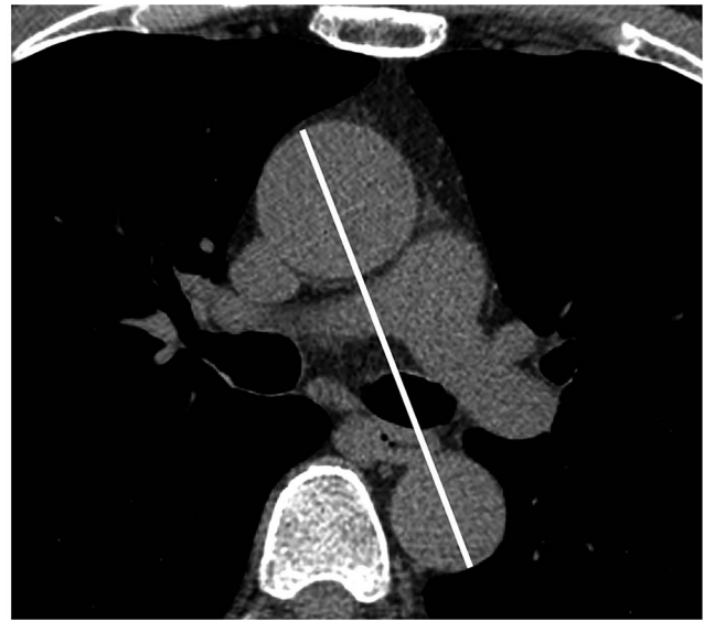
Figure 1. Measuring aortic unfolding. Aortic unfolding (white line) was defined as the longest distance between the ascending and descending aorta on a transaxial slice at the level of the pulmonary artery bifurcation on a selected coronary artery CT image. doi:10.1371/journal.pone.0095887.g001

Aortic unfolding was defined as the longest distance between the ascending and descending aortas, including the aortic lumen and aortic wall, on a selected CT slice at the level of the pulmonary artery bifurcation (Fig. 1). Two radiologists who were blind to the clinical information measured the aortic unfolding. To assess the intra-observer variability, each reader made two measurements in random order at an interval of at least 4 weeks. The mean value of