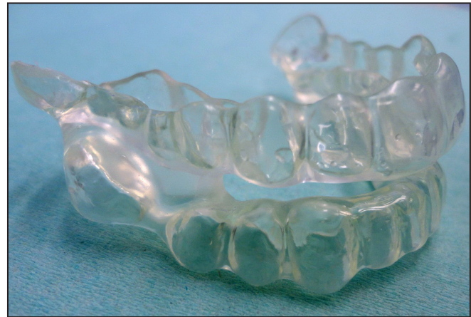
Figure 2. A mandibular advancement device designed with an opening in the anterior region of the device for breathing.

The patient's pre-treatment mean AHI in the classification groups of mild, moderate and severe, was registered and counted. AHI values in the supine position were also registered in the same manner. The changes in AHI (both mean and supine) were followed in the different severity groups both in ordinal numbers and in percentages according to pre-treatment classification groups (Table 2).