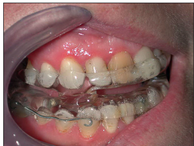
Figure 3. A mandibular advancement device in position in the mouth. Note the protrusion of the mandible set at 50% of the maximal protrusion.

Those, whose AHI fell below 5 with MAD treatment were considered to be cured (Tables 3 and 4). Since some studies consider responders to experience an improvement of AHI of 50% or more to be a success, these results are also tabulated to reflect to this concept for an additional comparison (Table 5).