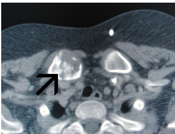
Figure 1 Computed tomography scan showing an osteolytic process with periosteal reaction of the right proximal clavicle.

fluorodeoxyglucose positron emission tomography (FDG-PET) was not available.