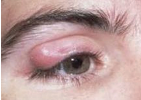
FIGURE 1: The lesion of eyelid on right eye.