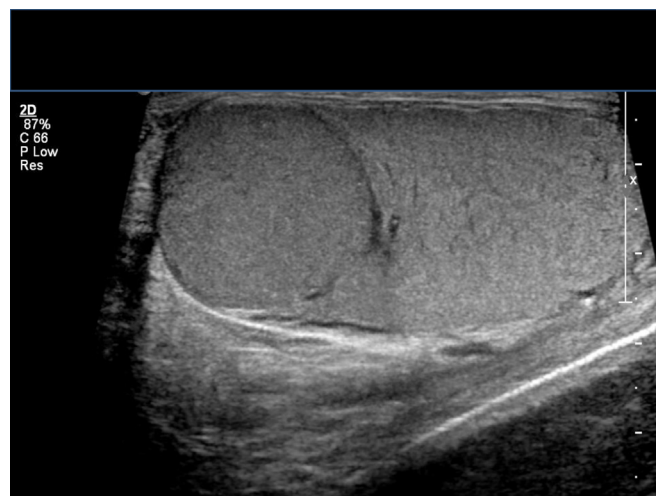
Figure 1. Rounded well-circumscribed intratesticular solid lesion.

metastatic disease. CT of the abdomen and pelvis showed no adenopathy in the retroperitoneum. Given the appearance on ultrasound and the history of new testicular mass, left radical inguinal orchiectomy was performed uneventfully. The pathology report revealed a spermatic cord lipoma, benign testicle and epididymis, and splenogonadal fusion with splenic tissue involving the superior pole, 2.5 cm in maximal diameter. The splenic tissue