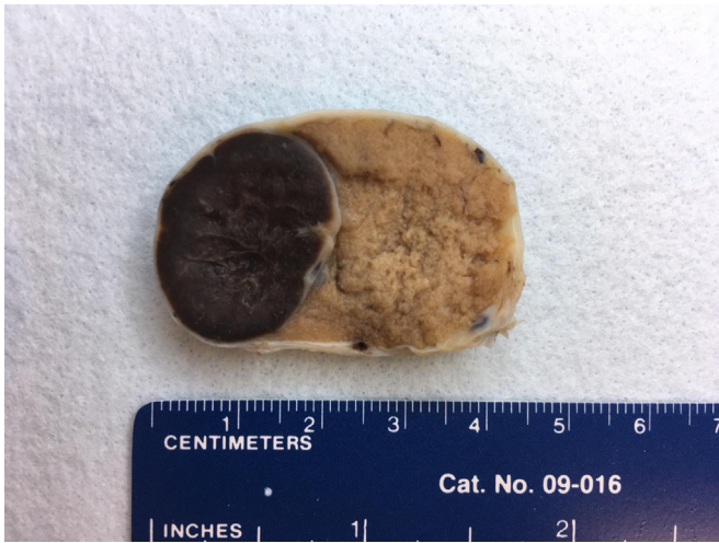
Figure 2. Gross specimen, with splenic tissue being darker in color.