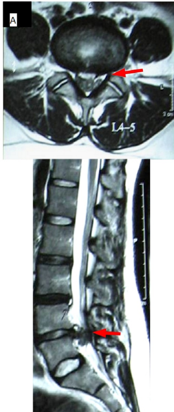
FIGURE 1: Axial and Sagittal T2W Images Pre-Procedure

Large postero-central disc protrusion at the L4-L5 level.