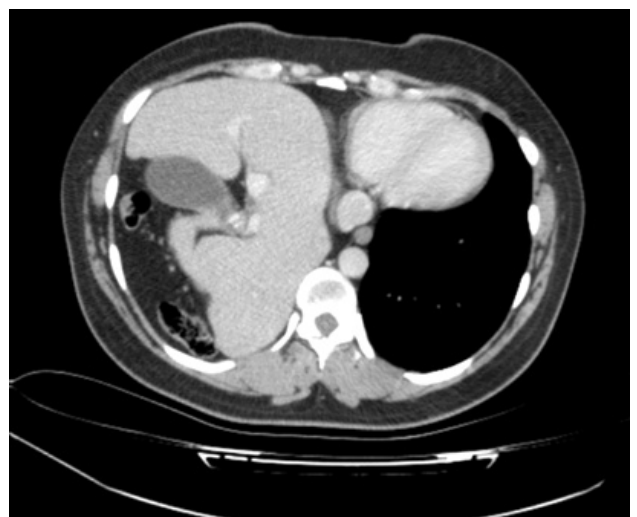
FIGURE 2. Computed tomography (CT), axial view

right hemithorax. Central tendon of the diaphragm was absent. Gallbladder was elevated and the tip of the fundus had a slight posterolateral rotation. Cholecystectomy was completed laparoscopically in about 45 minutes without the need for additional trocars. Patient was discharged on the second post-operative day without any complaint.