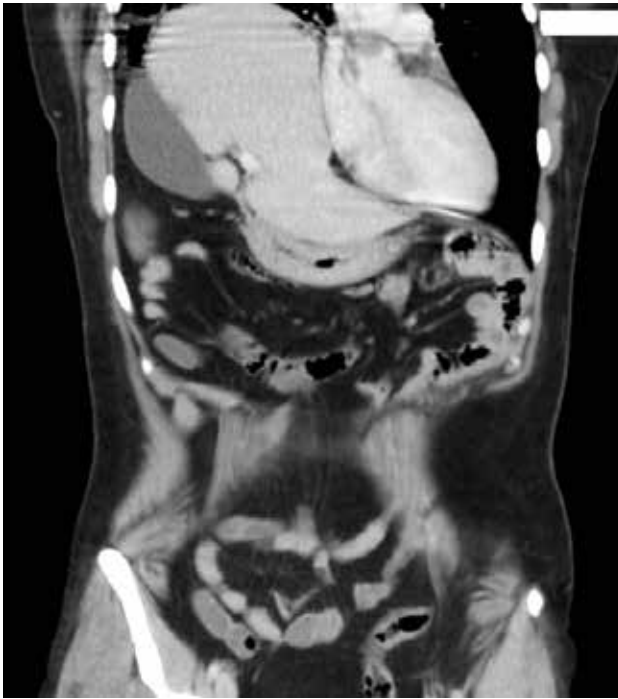
FIGURE 3. Computed tomography (CT), coronal view