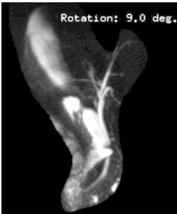
FIGURE 4. Magnetic resonance cholecho-pancreatography (MRCP)

On the eighth follow-up week, she was referred to the medical genetics clinic for mutational analysis. Chromosome analysis revealed a 46, XX, normal karyotype and a C677T heterozygous mutation of MTHFR gene. Echocardiogram was normal.