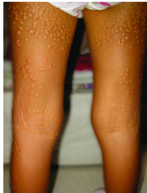
Figure 2 Xanthomas present on the extensor surface of the buttocks and thighs.

Ocular ultrasonographic examination in 20 children with ALGS found optic disk drusen in 90%. Retinal pigmentary changes are also common (32% in one study). 15 Although