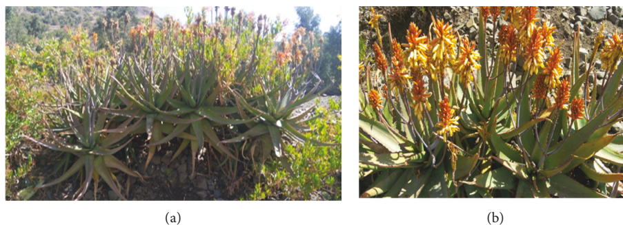
FIGURE 1: Photograph of A. adigratana (taken at Adiyonom, near Adigrat city).

nutrient agar while the Candida species were subcultured in Sabouraud dextrose agar (SDA). The turbidity of the inoculum was similar to the turbidity of 0.5 McFarland standard, which is supposed to contain a bacterial concentration of 1-2 \times 10^8 CFU/mL and fungal concentration of 1-5 \times 10^6 CFU/mL.