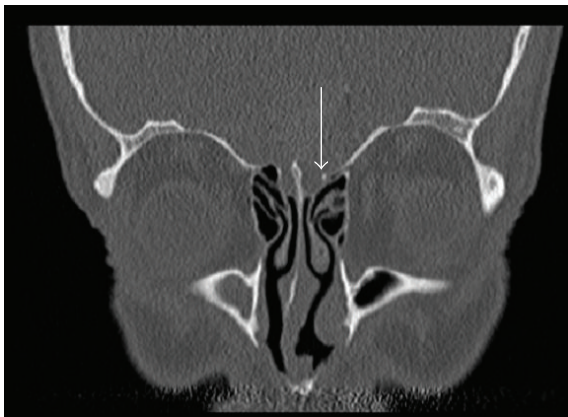
FIGURE 2: Ethmoid roof is "flattening" or shows a "broken wing" on the left side (arrow). Coronary CT scan of a patient with chronic sinusitis.

can cause a postoperative cerebrospinal fluid leak as well as meningitis [3, 11, 15, 16].