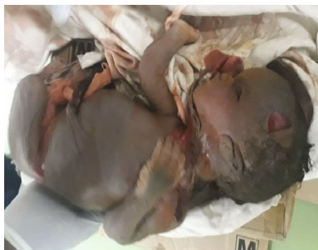
FIGURE 3: A 2000 gm female stillborn with grade-III maceration delivered from the peritoneal cavity.

or elective abortion, and after subtotal or total hysterectomy [2]. Potential sites of abdominal ectopic pregnancy include the omentum, pelvic sidewall, broad ligament, posterior cul-de-sac, abdominal organs (e.g., spleen, bowel, and liver), large pelvic vessels, diaphragm, and uterine serosa [6, 8]. The pouch of Douglas (POD) is the most common location of abdominal pregnancy followed by the mesosalpinx and omentum [8].