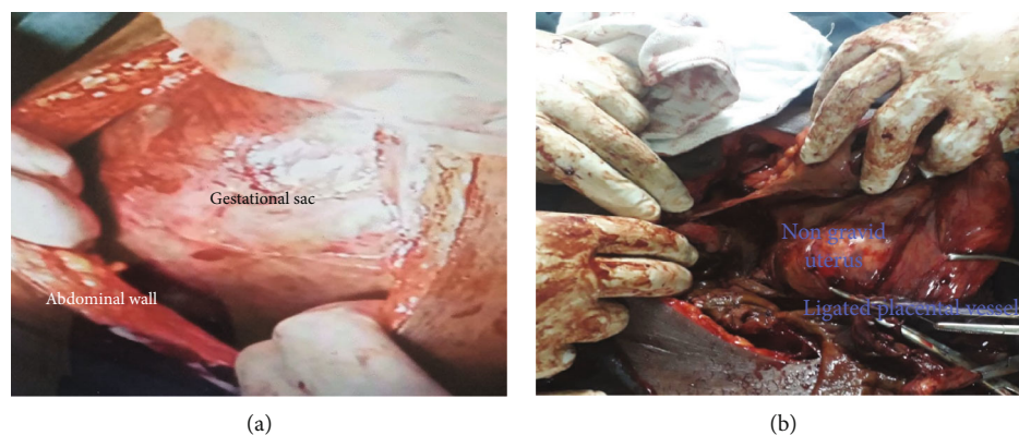
FIGURE 2: (a and b) Intraoperative findings showing gestational sac with the peritoneal cavity, nongravid sized uterus, and meconium-stained bowel.