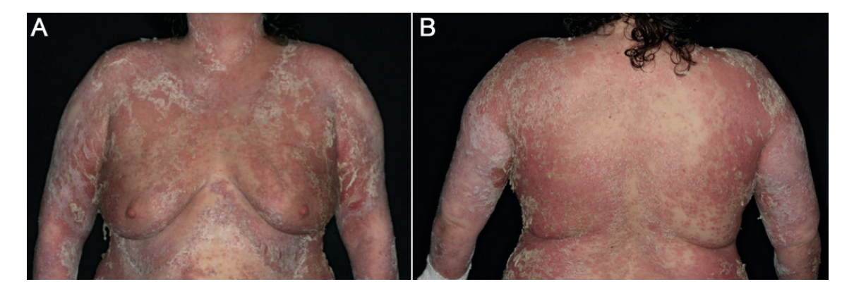
Fig. 4. (A and B) Front and back of a female patient with acute flare of generalized pustular psoriasis presenting with erythroderma, pustules, pustular lakes and erosions.