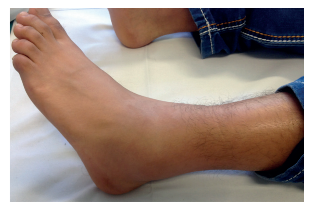
Fig. 3. Patient with familial Mediterranean fever with erysipelaslike lesion of the left lower leg and accompanying arthritis of the left ankle joint.