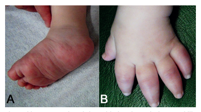
Fig. 5. Skin symptoms in an infant with chronic atypical neutrophilic dermatosis with lipodystrophy and elevated temperature. (A) Erythematous papules and plaques on the right foot and right lower leg. (B) Purplish oedematous plaques on the fingers that resemble perniotic lesions with accompanying swelling of the hand.

The NOD2 pathway is involved in the innate immune defence against invading pathogens. NOD2 is a member of a family of pattern recognition molecules and is mainly expressed by antigen-presenting cells and intestinal Paneth cells (87, 88). It contains 2 N-terminal CARD domains for downstream signalling through