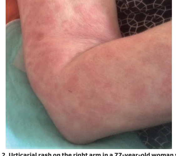
Fig. 2. Urticarial rash on the right arm in a 77-year-old woman with cryopyrin-associated periodic syndrome.

In up to 40% of patients with FMF, ervsipelas-like skin lesions are reported. Those non-infectious lesions mostly affect the lower extremities and present as ervthematous, painful infiltrated oedema (40, 45). Erysipelaslike lesions resolve spontaneously within several days and can be accompanied by fever and/or arthralgia (Fig. 3) (41). These skin lesions are typical for patients with FMF and do not occur in the context of other autoinflammatory disorders. Histopathologically, erysipelas-like lesions show dermal oedema and sparse perivascular infiltration of lymphocytes and neutrophils. Direct immunofluorescence revealed deposition of C3 in the small vessel wall of the superficial vascular plexus (46). Also, a strong association of FMF with polyarteriitis nodosa and Henoch-Schönlein purpura was reported (47-49). Less frequently, patients with FMF can present with other skin symptoms, such as purpuric exanthema and urticarial rash, diffuse palmoplantar erythema, Raynaudlike phenomena and erythema nodosum (50, 51). As a