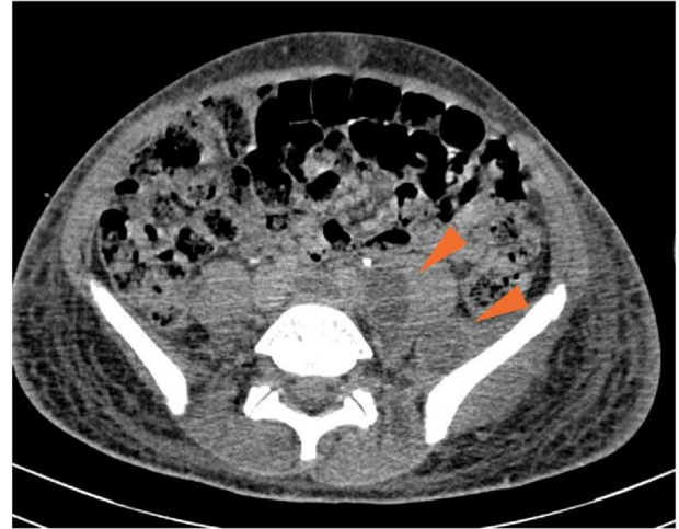
Computed Tomography of the abdomen: The image evidenced an extensive abscess in the left psoas, shown here by the red arrows.

On October 19 th , 2019, a 15-year-old boy from a low-income neighborhood of Rio de Janeiro, with no previous history of travel outside Brazil and with no comorbidity, entered a Brazilian university hospital with a two-week history of lumbar pain and polyarthralgia after a body trauma during a soccer game. Upon admission, the patient was febrile and presented edema, redness, and heat in right elbow and left shoulder, suggesting a disseminated and complicated S. aureus SSTI. Computed tomography (CT) of the abdomen evidenced an extensive abscess in left psoas (Fig. 1) and peripheral pulmonary embolic lesions, with no documentation of endocarditis in the transesophageal echocardiogram. Also, a magnetic