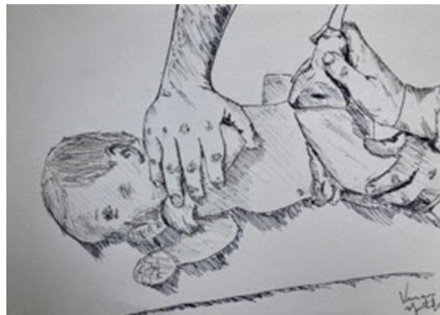
Fig. 1 Correct position of the newborn during the exam: lateral decubitus, with the lower limbs flexed and adducted. Credits: art by Vinicius Mustafa.

The newborn is positioned in lateral decubitus, opposite to the hip to be examined, with the leg slightly flexed and