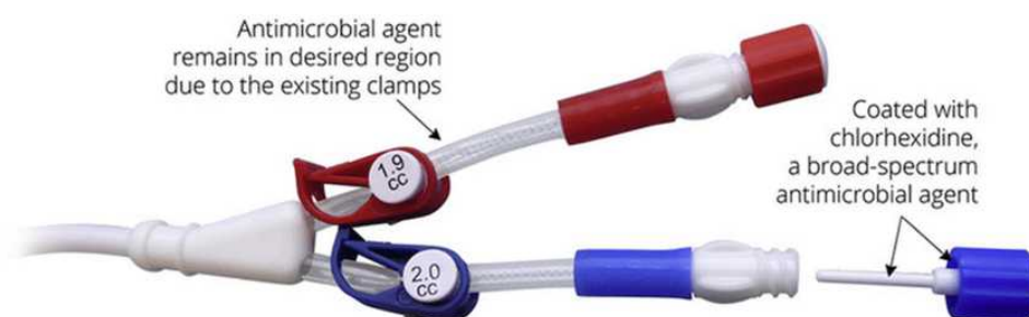
Figure 1 Antimicrobial barrier cap (ClearGuard™ HD) used in the chlorhexidine group.

The chlorhexidine-coated CVC caps used were ClearGuard HD Antimicrobial Barrier Caps (ICU Medical, San Clemente, CA, USA), which are equipped with chlorhexidine-coated cap threads and a chlorhexidine-coated rod that extends into the hemodialysis catheter hub (Figure 1). Therefore, attaching the cap to the dialysis catheter hub results in the local dissolution of concentrated chlorhexidine within the lock solution between the tubing clamp and the cap. The chlorhexidine-coated CVC cap was removed from the catheter at the time of dialysis and discarded. The dialysis catheter hub was then cleaned with an alcohol wipe. The lock solution was aspirated until 5 mL of