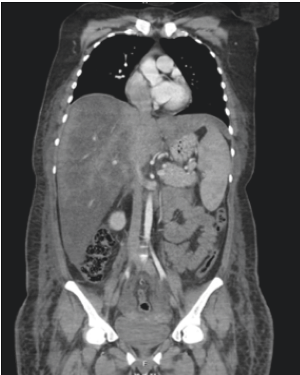
FIGURE 2: Computed tomography that shows massive hepatomegaly (29 cm) and splenomegaly (16 cm).

and alanine aminotransferase 58 UI/L) and lactate dehydrogenase (2419 UI/L), cholestasis (alkaline phosphatase 816 UI/L and gamma-glutamyl transferase 514 UI/L), coagulopathy, and extreme hyperferritinemia (49250 ng/ml). A bone