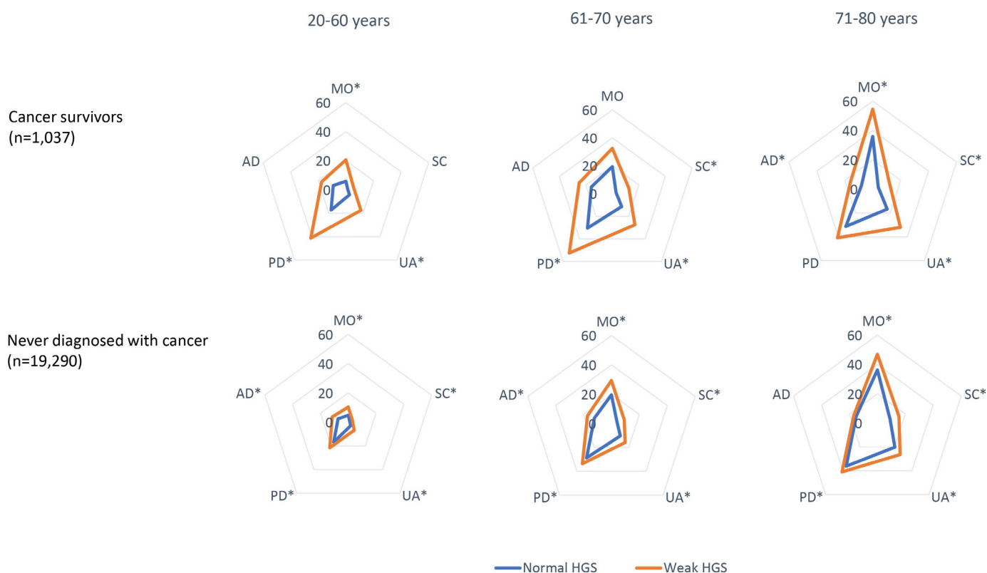
Figure 2 Radar chart plot of the percentages of participants with impaired health-related quality of life according to age group in cancer survivors (compared with general population). Asterisk indicates a significantly ( p value<0.05) larger percentage of impairment in health-related quality of life (some or extreme problems in EQ-5D dimensions) in the weak hand strength group compared with that in the normal group. AD, anxiety/depression; EQ-5D, EuroQoL-5 dimension; HGS, hand grip strength; MO, mobility; PD, pain/discomfort; SC, self-care; UA, usual activity.

The baseline characteristics are reported as means and SD for all continuous variables and as frequencies and percentage for categorical variables. The differences in several covariates between the normal and weak HGS