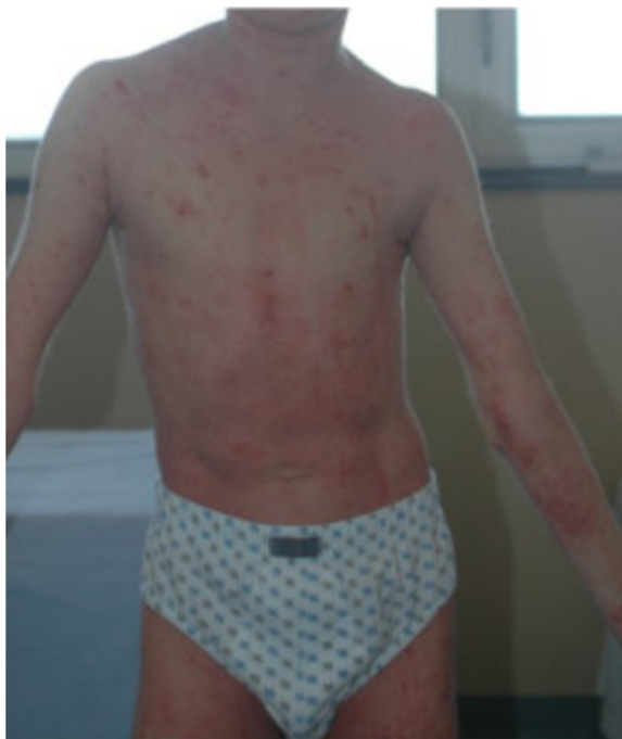
Figure 1 Atopic dermatitis.

the basal value of somatomedin C was extremely low (109ng/ml; normal range, 247ng/ml to 482ng/ml), we performed an arginine test to evaluate the hGH release from the pituitary gland after stimulation with arginine (Table 1). The laboratory test showed a hGH level less than 10ng/ml after 60 minutes. His sex hormones, prolactin and cortisol levels were all normal.