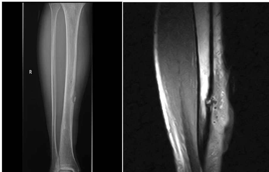
Fig. 1 A lesion resembling osteomyelitis on a computed tomographic scan of the left lower limb

When bone is affected, the patient is normally asymptomatic. The presentation of sarcoidosis is described as lytic and cystic lesions on the fingers and toes (42%) that do not generally require treatment. However, soft tissues can be affected, with formation of fistulas on the skin that require curettage and corticosteroid therapy or chloroquine, which generally work very well with